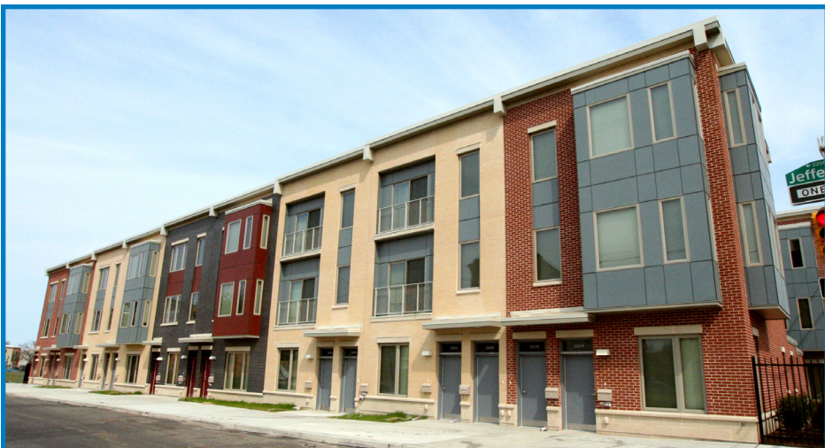
Blumberg Phase 1: 57-units ; Grand Opening November 2016